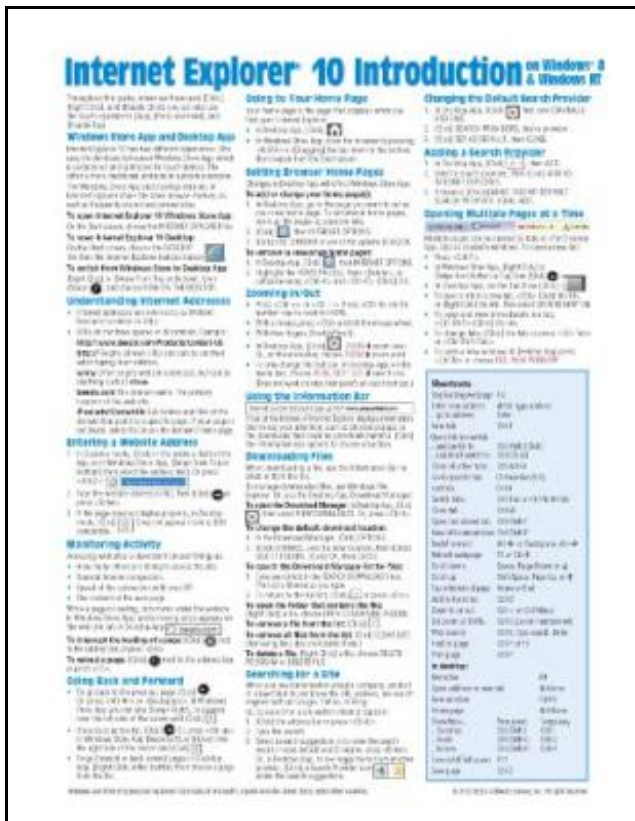
Filesize: 4.06 MB